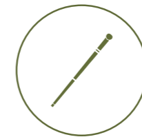
100 mobility sticks to the visually challenged women

The ladies later visited Nilacharal, an NGO that supports the education of rural visually challenged girls and children of poor widows. On being presented dresses and sarees that they had requested for, the young girls thanked the Prayas team wholeheartedly and took the opportunity to share their dreams for the future.