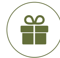
Gifts and utility items